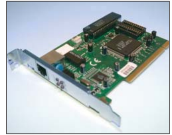
Optional PC reset card (PCR-95-3)