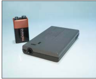
Optional serial data collector (SDC-876-1)